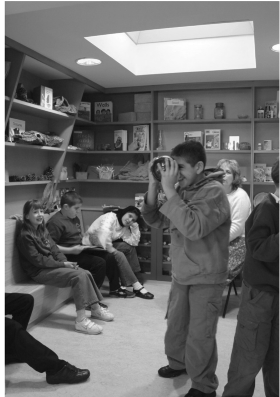
Image 23: Individualised teaching space Credit: Sarah Wigglesworth Architects