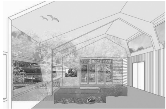
Image 25: Relationship to nature Credit: Sarah Wigglesworth Architects

The building forms a natural gateway to a nature conservation area (see Image 25 ). The teaching space overlooks this area, which enables the children to experience the natural habitat of plants and animals all around. Indeed the building is intended to encourage wildlife to inhabit places within it. There is a window under the building and the hope is to encourage a badger sett to live there. The 'crib' wall to the north is home to a myriad of plants and wildlife. The teaching space has framed views of the meadow, picture windows and a balcony that addresses the pond. The clerestory lets in a different type of light from the north and gives a view of the sky. Additionally there are plasma screens, which often show an enhanced view of things. Cameras are mounted on and around the building and the pond, bringing an enhanced view of the world into the classroom.