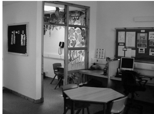
Image 5: Individual tuition space Credit: Aitken Turnbull Architecture

The classroom threshold spaces discussed above also help to bring down the scale of the main, atrium space and can be used for small-group activities.