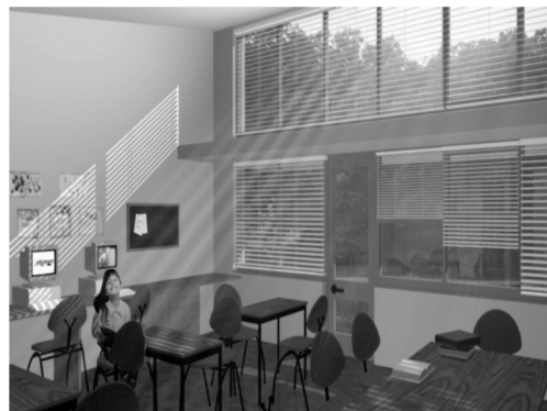
Image 6: Architect's image of typical classroom incorporating brise-soleil Credit: Aitken Turnbull

C The classroom section incorporates clerestorey lighting, with a brise-soleil, (see Image 6 ), which diffuses direct sunlight, throwing it up onto the ceiling. The windows and doors below this have opaque blinds, which can be manually operated. The system of artificial lighting mimics the source of natural light by throwing light up onto the ceiling in the same way, from above the clerestorey sunbreak.