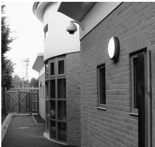
Image 16: Window to circular court

The circle is a strong platonic geometry and provides a powerful orientation device. The short circulation space which leads from the entrance to the court is also designed to feel non-institutional, using curved walls and is 2 m wide.