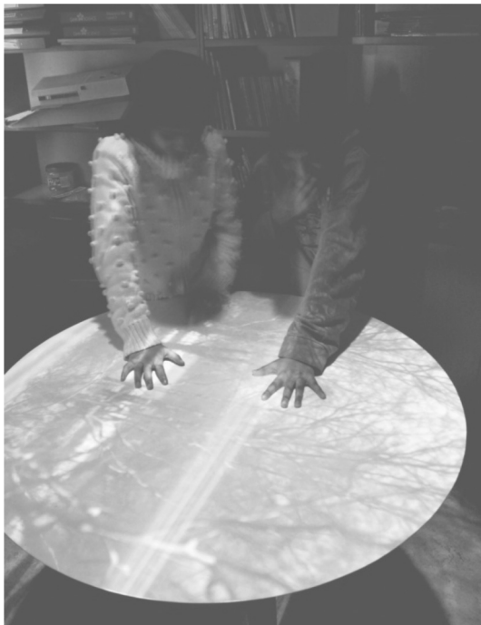
Image 24: Environment as learning tool Credit: Sarah Wigglesworth Architects

rather than acting as an exhibit (see Image 24 ). The building therefore utilises different materials, allowing the children to learn about them at close hand. It has metal walls, which are reflective and get hot and cold, it also has timber externally, which evolves over time. Polycarbonate sheeting provides an experience of translucency from both inside and out. There is also a 'living wall' to the north side where the building backs onto an existing sensory garden. It has plywood patterning to the internal walls and a clear and legible structure of portal frame. There are felt covered cupboards and a transparent toilet cistern that illustrates the flush mechanism. It has windows to the meadow, the sky and a window set in to the floor which allows the children to experience the movement of life below ground. One of the resource rooms operates as a 'camera obscura' from where you can watch life going on all around the building. Through all of this the building functions as a learning tool for the children of the unit.