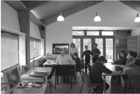
Image 21: Main science teaching class

The other principal space is a ball pool (see Image 22 ), which gives the children instant access to physical exercise in all weathers. As previously stated, Daily Life therapy pioneered in Japan stresses the importance of physical exercise as part of the working day.