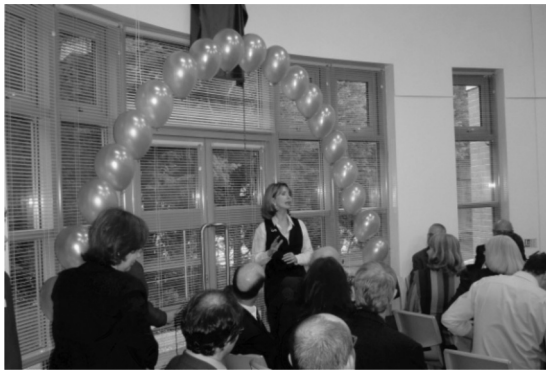
Image 15: Circular court space. School opening with National Autistic Society President, Jane Asher Credit: GA Architects

This has resulted in a circular ‘assembly’ or court space. (see Image 16 ). All but one of the classrooms open directly into this court, which also is connected to the library and external green space. The space is well lit by picture and clerestorey windows and is designed to be calming and non-institutional.