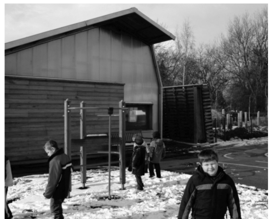
Image 20: Mossbrook Science teaching base